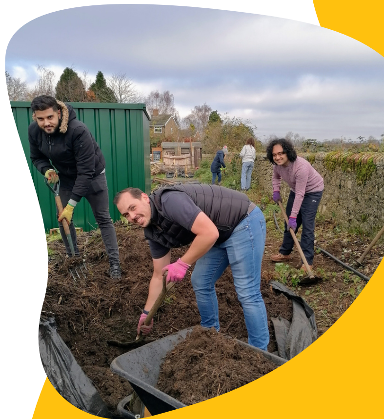
PRACTICAL SUPPORT ON OUR WILDLIFE WALK FROM KCC

Crossroads Kent Young Carers East Malling Centre East Malling Trust IMAGO Community Involve Kent Kent County Council Kent Virtual Schools KRAN - Kent Refugee Action Network NIAB Space 2 Be Me Tonbridge & Malling Borough Council – One YOU