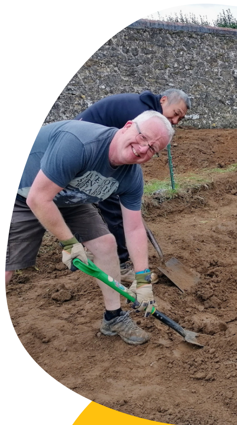
PERRYS CHARTERED ACCOUNTANTS, POND DIGGING